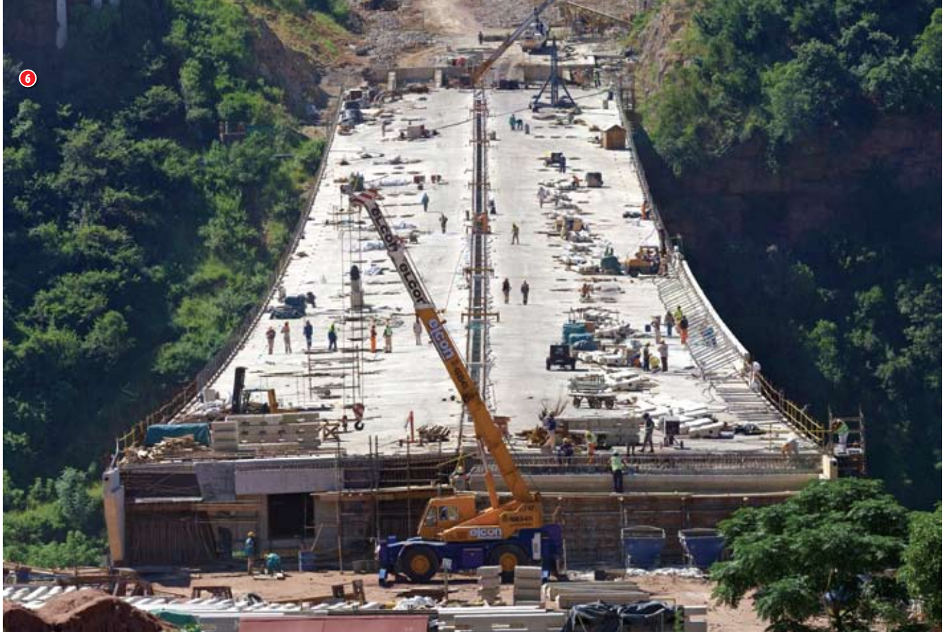
6 A telephoto shot down the centre line of the Mgeni Viaduct

to set the system to shut down if the anticipated launch force required for launching of that segment was exceeded. This could have occurred if a bearing had been fed in upside down or an obstruction encountered.