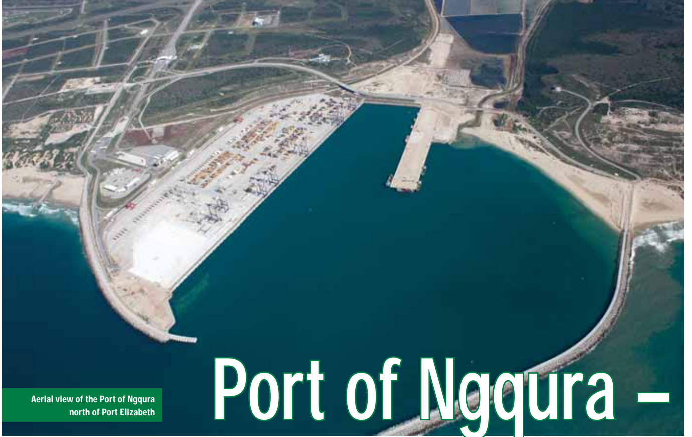
Aerial view of the Port of Ngqura north of Port Elizabeth